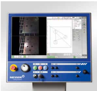
The new Global Control with 24" touch screen monitor offers much room, a clear operator guidance and can be flexibly configured if required