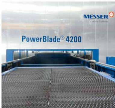
The full enclosure and shuttle table guarantee absolute laser safety for the fibre laser