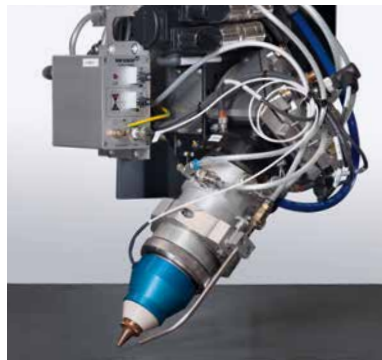
The infinitely rotating bevel head with magnetic collision protection enables bevel cuts up to 50°