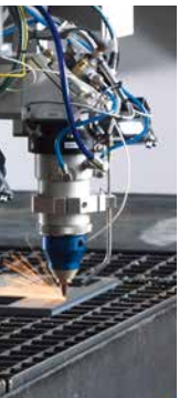
in parallel make cutting output