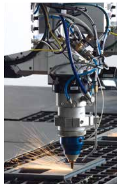
Two laser heads operating it possible to double the c